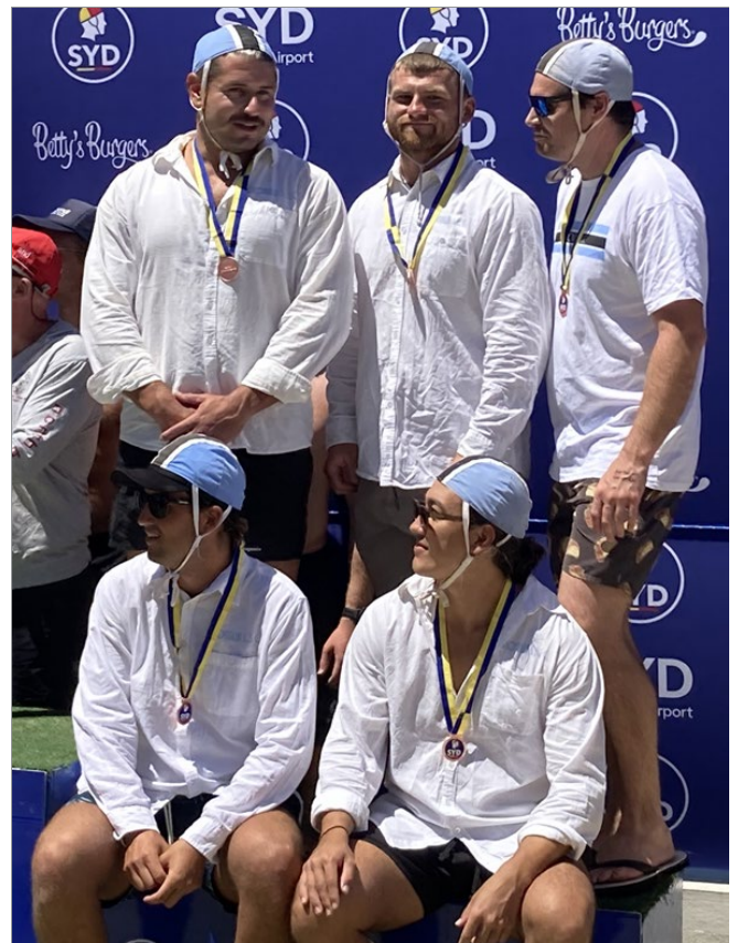
Branch Bronze Medal Winners at Maroubra