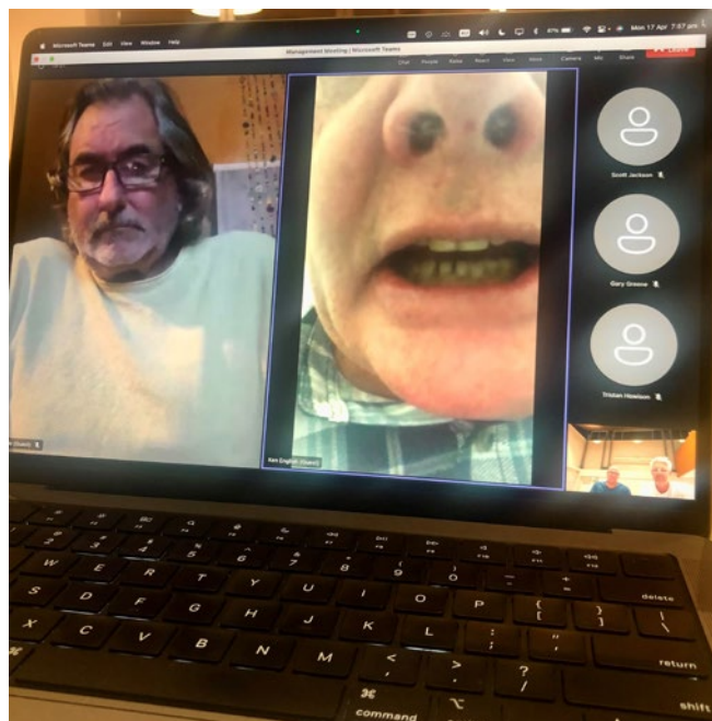
Club Patron addressing MC