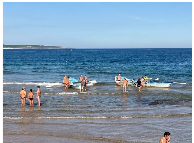
A highlight of our season was getting all the crews together for training – something very hard with different work, family and study commitments. The members of the section have had a great time in each others company and thank you to our more experienced rowers and sweeps that have selflessly given so much time and attention to the young and novice rowers.