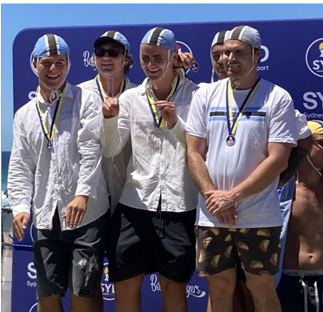
Branch Silver medal winners